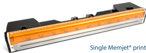
Single Memjet® printhead design for all colors CMYK