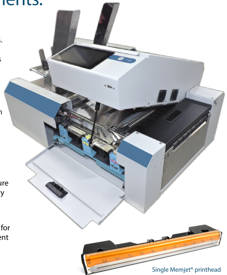
Single Memjet® printhead design for all colors CMYKK

The adjustable media guide quickly accommodates for sheets and envelopes of different shapes, sizes and widths between 3" to 10.5" (76 mm to 266.7 mm) and up to 0.02" (.5 mm) in thickness.