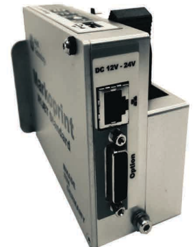
Ethernet Data Transfer from networks and Web Interface