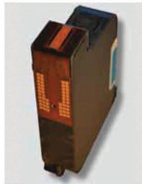
Maintenance-free HP cartridge Perfect print quality - High reliable inks with up to 15 hours decap