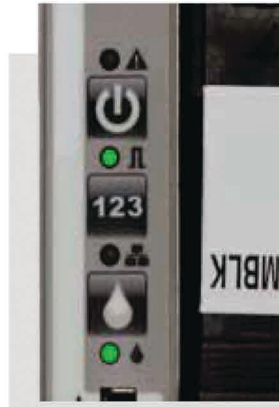
3-Logic User Interface LED indicators for intuitive use

Compact, independently operating printhead for simple integration into existing production lines.